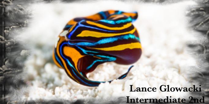
Lance Glowacki Intermediate 2nd

The topic of the Photo Contest this month is: “curves” including fish, invertebrates or even non-living things.