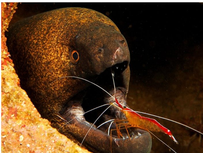
Advanced 1st place