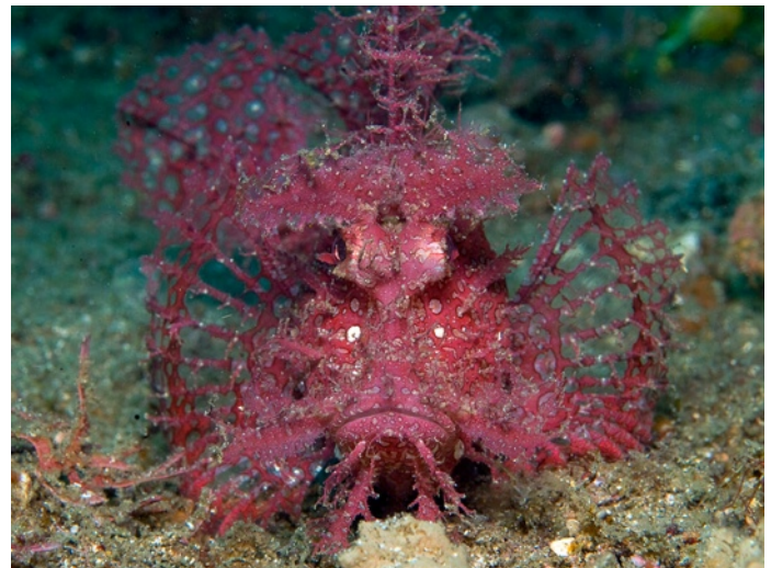
Advanced 2nd place

Entries for the monthly contest should be emailed to photocontest@hups.org at least 48 hours prior to the meeting. This mailbox is reserved for entries only. If you have a question regarding the digital contest send your email to ddeavenport@comcast.net or underh2o@mac.com . Complete contest rules can be found at http://www.hups.org . Please be sure to adhere to the file naming instructions. If you do not follow all the rules for digital entries your images will not be judged.