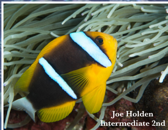
Joe Holden Intermediate 2nd