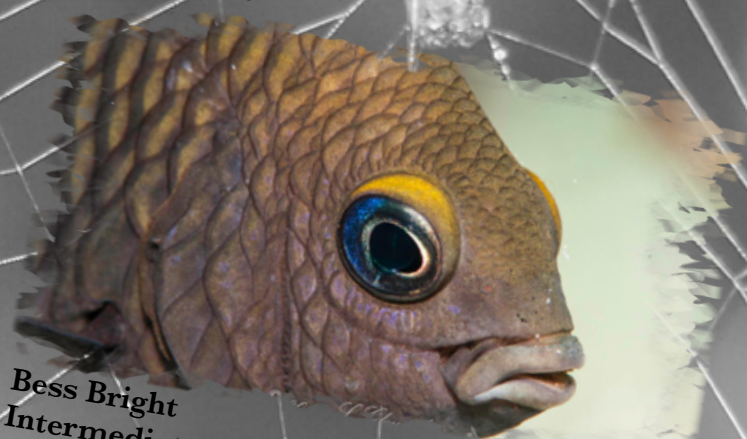
Bess Bright Intermediate 3rd