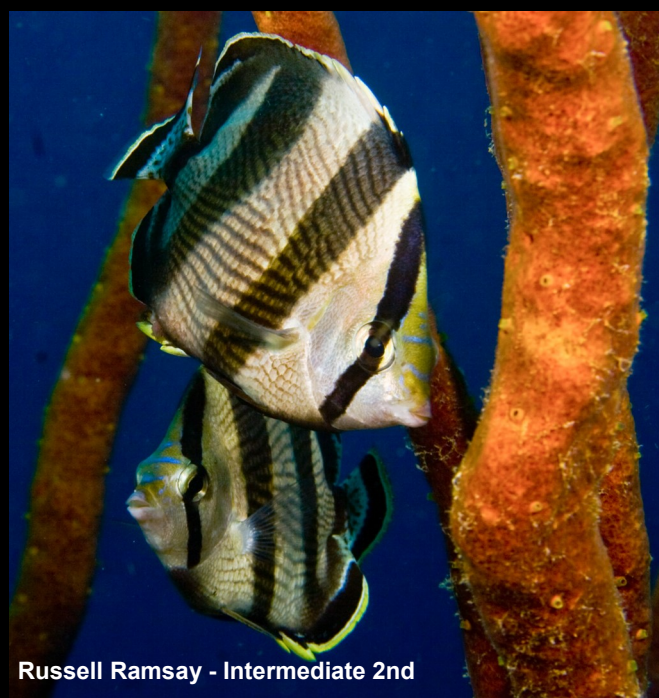
Russell Ramsay - Intermediate 2nd