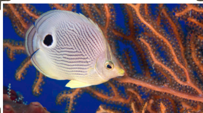
Bess Bright Intermediate 2nd