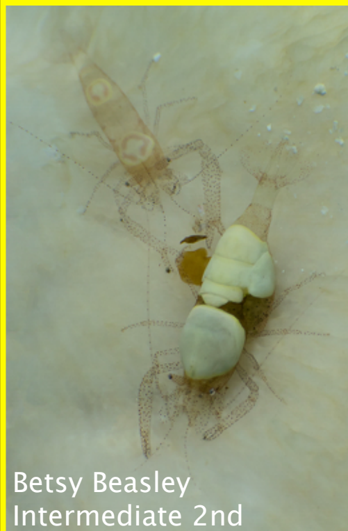
Betsy Beasley Intermediate 2nd