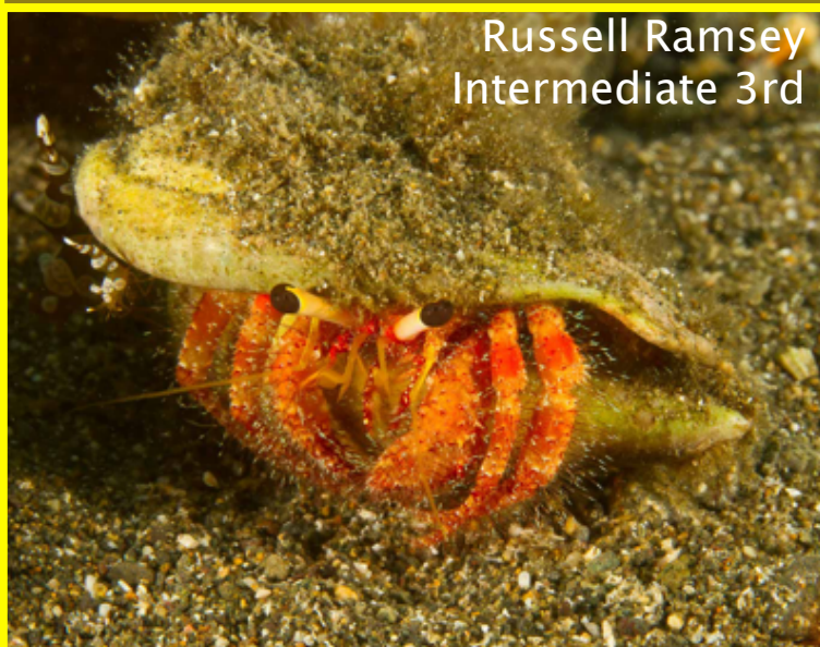
Russell Ramsey Intermediate 3rd